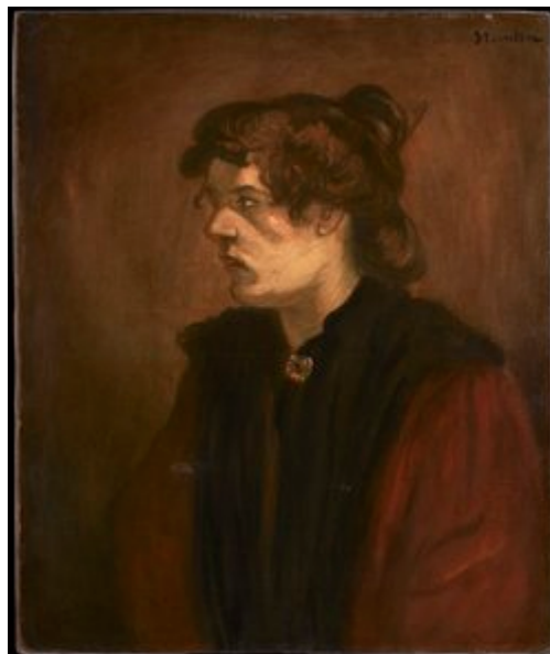
Théophile Alexandre Steinlen

The increase in illegal prostitution (which was seven to eight times higher than legal prostitution), the growth of certain venal practices such as prostitution by women working in low-paid trades, and the rise in the number of brasseries à femmes , sounded the death knell for the regulatory system in the late 19th century. An abolitionist movement emerged, promoted by feminists (Joséphine Butler) and radical Republicans (Yves Guyot). The loi Marthe Richard bill, which ordered the closure of brothels, was passed on 13 April 1946 and can be viewed as the legacy of this trend.