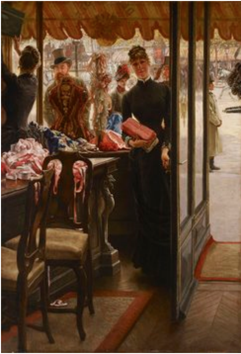
James Tissot The Shop Girl

However, streetwalkers blended into the crowd, detectable only by their words, actions (a skirt lifted to reveal a glimpse of ankle boot), contrived poses or eloquent expressions (a hint of a smile, a furtive or meaningful look) as depicted in the works of Boldini and Valtat. These fluid, intangible identities fascinated artists, who recreated the ambiguous climate of modern Paris in works where their contemporaries recognised the variously encoded allusions to the world of prostitution.