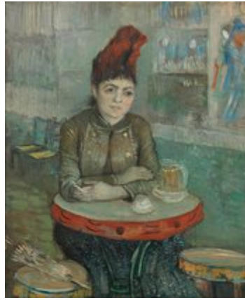
Vincent van Gogh Agostina Segatori Sitting in the Café du Tambourin

"For me, the finest thing about Paris is the boulevards. [...] When the gas lamps shine in mirrors and knives clatter on marble table tops, I stroll there at my ease, in a cloud of cigar smoke, looking right through the women passing by. This is where prostitution lays out its wares, and where eyes sparkle!" These lines written by Gustave Flaubert to