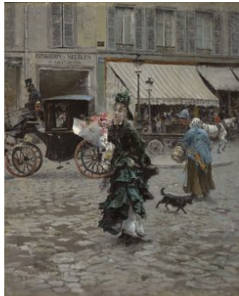
Giovanni Boldini Crossing the Road

around cafés – establishments never frequented by respectable women without a chaperone. Café terraces were strategic positions for soliciting prostitutes, who could simultaneously be seen from the inside of the establishment and the street. At "absinthe time" in the early evening, they sat at tables with a drink and waited for customers, cigarette in hand, as depicted in works by Manet, Degas and Van Gogh.