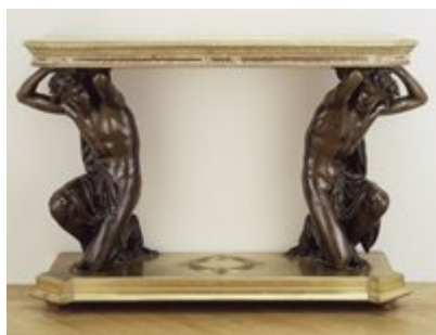
Albert-Ernest Carrier-Belleuse, Aimé Jules Dalou, Pierre Manguin Console for the Grand Salon in the Hôtel de Paiva

Prominent demi-mondaines were often experienced businesswomen and were careful to build up significant assets in the form of money and property. The pinnacle of success for them was to negotiate the gift or construction of a town house and, once they had accumulated sufficient wealth, to set their sights on a marriage which would offer them a distinguished name and new-found respectability.