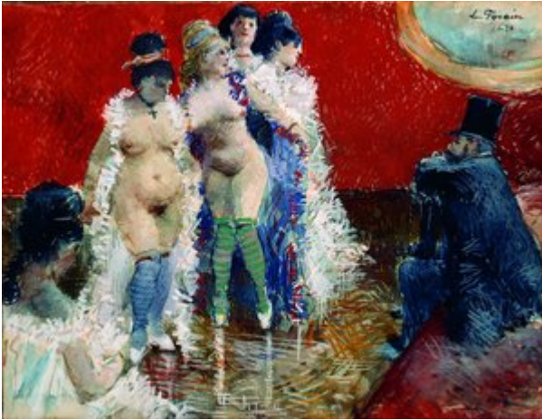
Jean-Louis Forain The Client