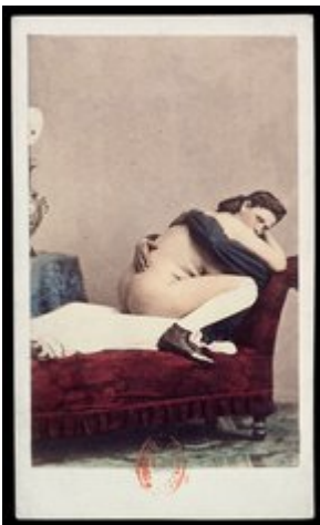
Anonymous Untitled

of brothels, but brasseries à femmes continued to proliferate. Only the most exclusive, lavishly decorated establishments for a prosperous clientele survived.