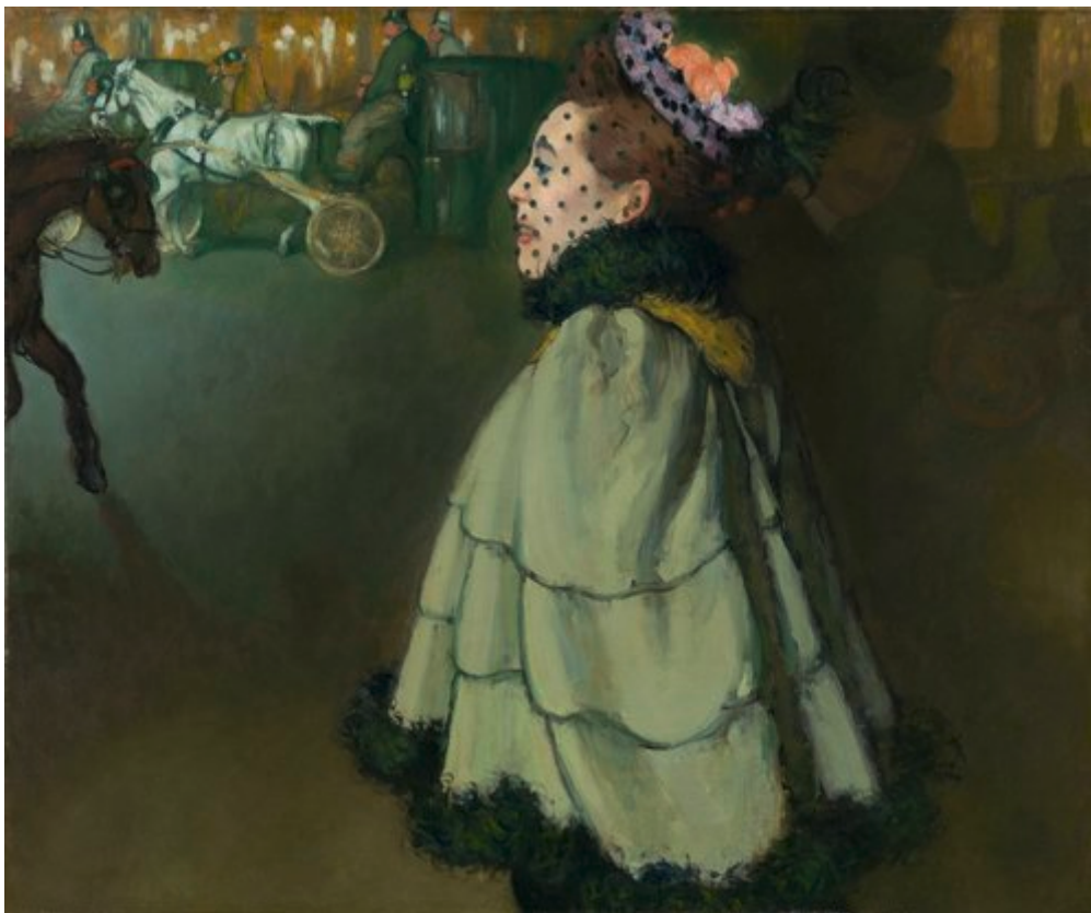
Louis Anquetin Woman at the Champs-Élysées by Night

Ernest Chevalier (25 June 1842) describe the spectacle of prostitution on display in a Paris transformed by the building of the boulevards and new street lighting.