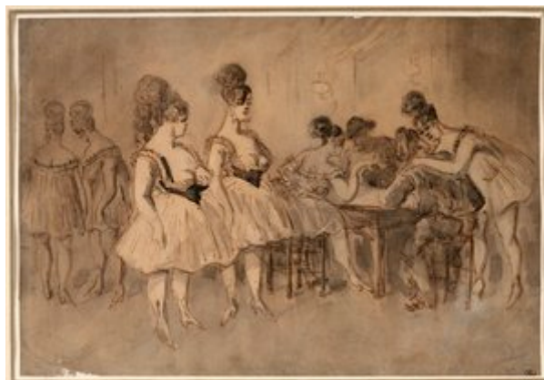
Constantin Guys Men at Table in the Company of Scantily Clad Women

Toulouse-Lautrec was unique in capturing the human face of the prostitutes of his day. He did not paint them as femmes fatales or victims of society, but as ordinary women going about their daily business. In 1893 and 1894, the artist shared the life of prostitutes in brothels on the Rue