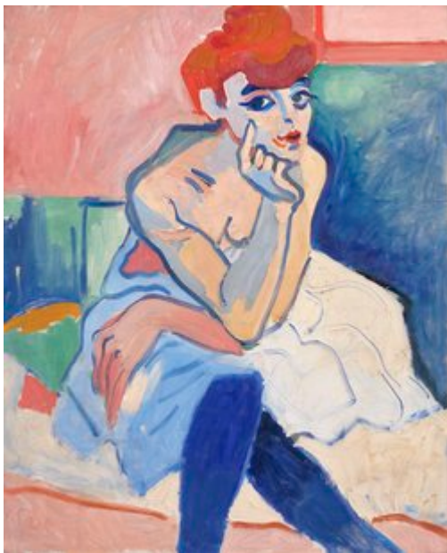
André Derain Woman in a Chemise or Dancer © Adagp, Paris, 2015 - SMK Photo

geometrical. This radicalisation of the treatment of forms divested images of prostitution of their documentary, moral and allegorical content.