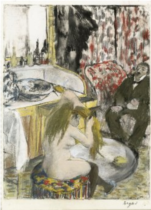
Edgar Degas Nude Woman Combing her Hair

d'Amboise and the Rue des Moulins. In the pictures he left behind documenting these encounters, he conveys the impression of a life which was peaceful, but deeply imbued with melancholy.