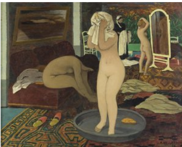
Félix Vallotton Women Washing