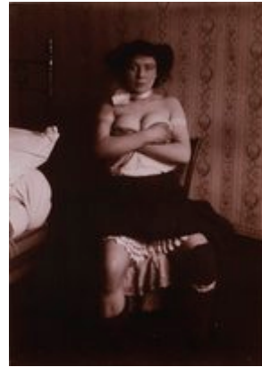
Anonymous Nude Studies, seated woman with arms folded

Picasso provides an example of the variety of possible approaches to the subject. Although he initially represented prostitutes using a caricatured and colourful treatment reminiscent of Toulouse-Lautrec, during his blue period he attributed a deeper and more symbolic importance to this same theme. His painting depicting an inmate of Saint-Lazare by moonlight conveys empathy for his model's melancholy and resembles a psychological portrait. Several years later, he eliminated the anecdotal element entirely in Les Femmes d'Alger , focusing instead on extremely brutal expressiveness, which opened up a new field for modern art.