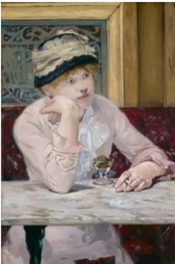
Edouard Manet The Plum © Courtesy The National Gallery of Art, Washington

Street prostitution was largely organised