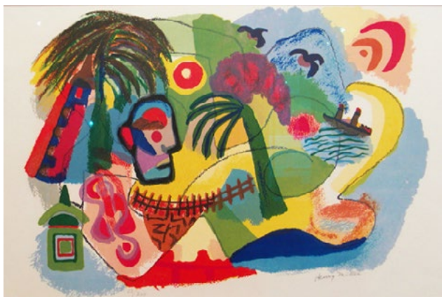
Henry Miller, Hawaiiian Serenade

Henry Miller painted as passionately as he wrote. He produced more than 2,000 watercolors which have not been seen in France since 1967, but are sought after in the USA and Japan.