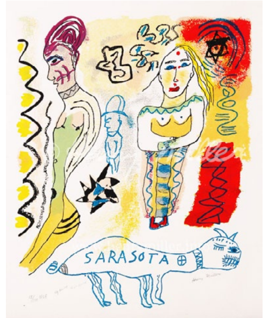
Henry Miller, Sarasota

His watercolors reveal the soul of a joyful child, who brilliantly created “portraits, seascapes, dreamscapes and escapes”. (Lawrence Durrell “The paintings of Henry Miller; Paint as you like and die happy”).